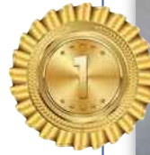
'Obutstudan for My Home' (group project)